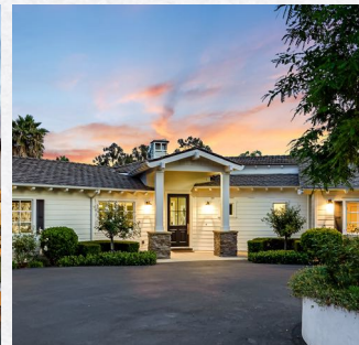
6531 MIMULUS RANCHO SANTA FE SOLD FOR $4,800,000