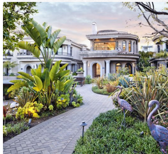
242 DATE AVE CARLSBAD SOLD FOR $3,150,000