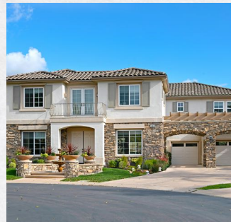
1461 SPYGLASS CT ENCINITAS SOLD FOR $2,400,000