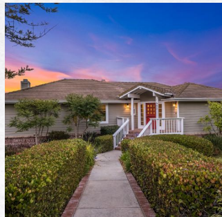
1482 RANCHO ENCINITAS ENCINITAS SOLD FOR $2,157,000