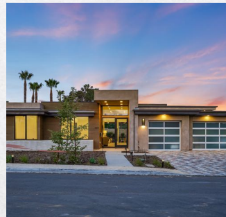
1809 GWYNN DRIVE CARDIFF BY THE SEA SOLD FOR $3,625,000