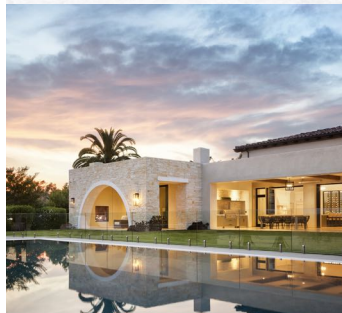
16568 LA GRACIA RANCHO SANTA FE SOLD FOR $10,850,000