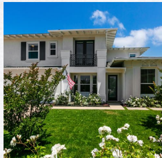
901 CHANNEL ISLAND DR ENCINITAS SOLD FOR $3,500,000