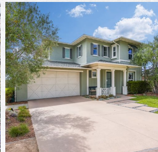
896 CHANNEL ISLAND DR ENCINITAS SOLD FOR $3,100,000