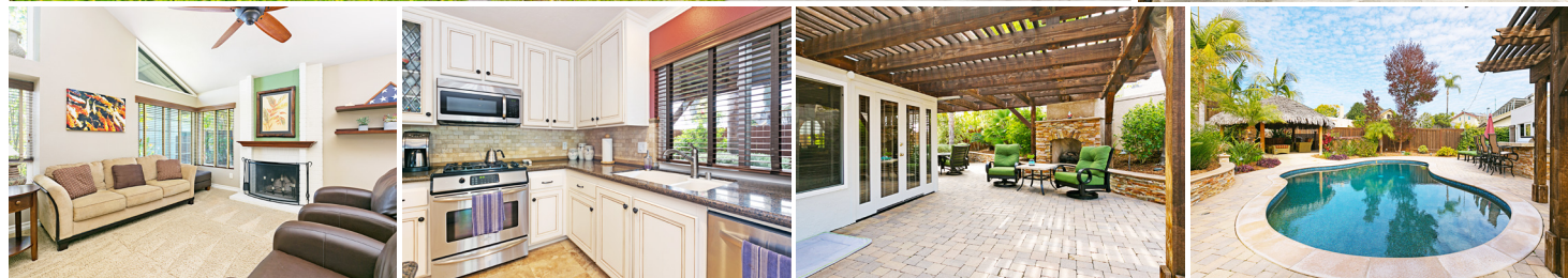
270 SHARP PLACE | 4 BEDS | 2 BATHS | 1,830 SQ. FT. | SOLD FOR $1,101,270